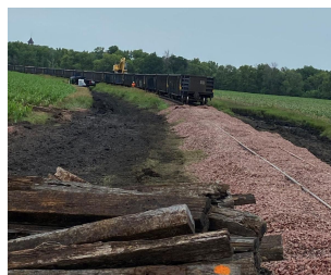
D & I operating crews, LGE Maintenance of Way, Herzog and Niewohner Construction working together to begin the recovery process.